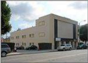
1 9916 Santa Monica Blvd

Multi-Property sale on 12/14/2001 of 2 properties, for $6,000,000 ($401.63/SF) - Research Complete