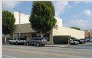
2 9908 Santa Monica Blvd